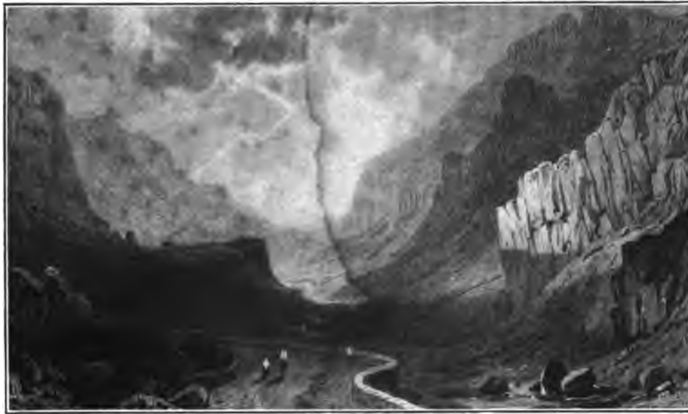
PASS OF LLANBERIS